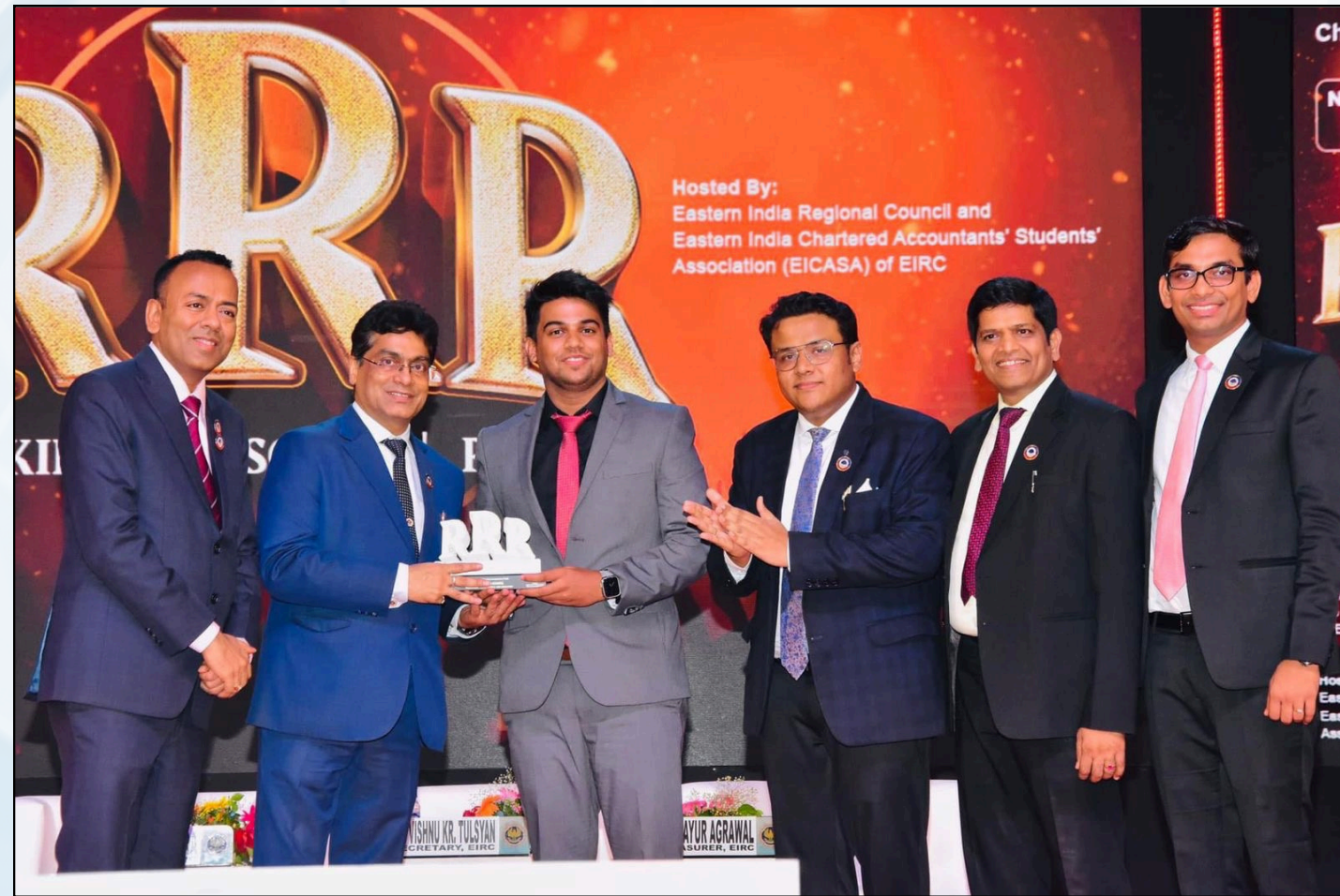
Honoured to receive the prestigious award at ICAI National Conference