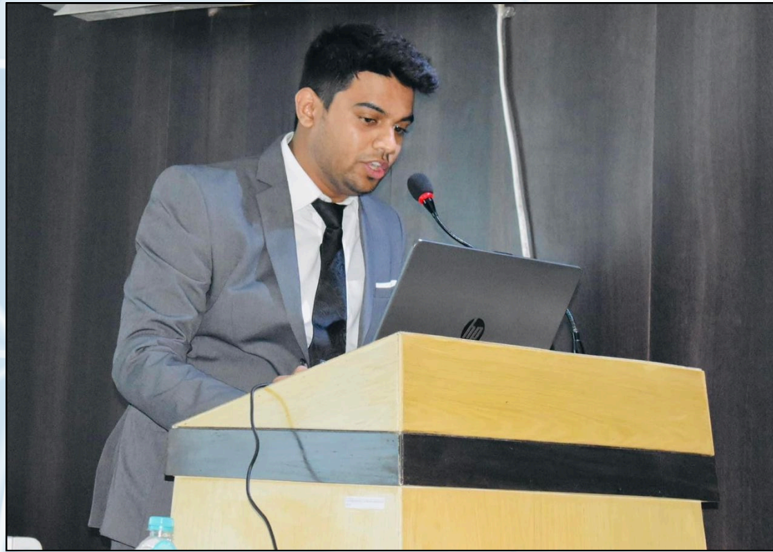
Deliberating a seminar on “GSTR- 9 & GSTR-9C, at ICAI