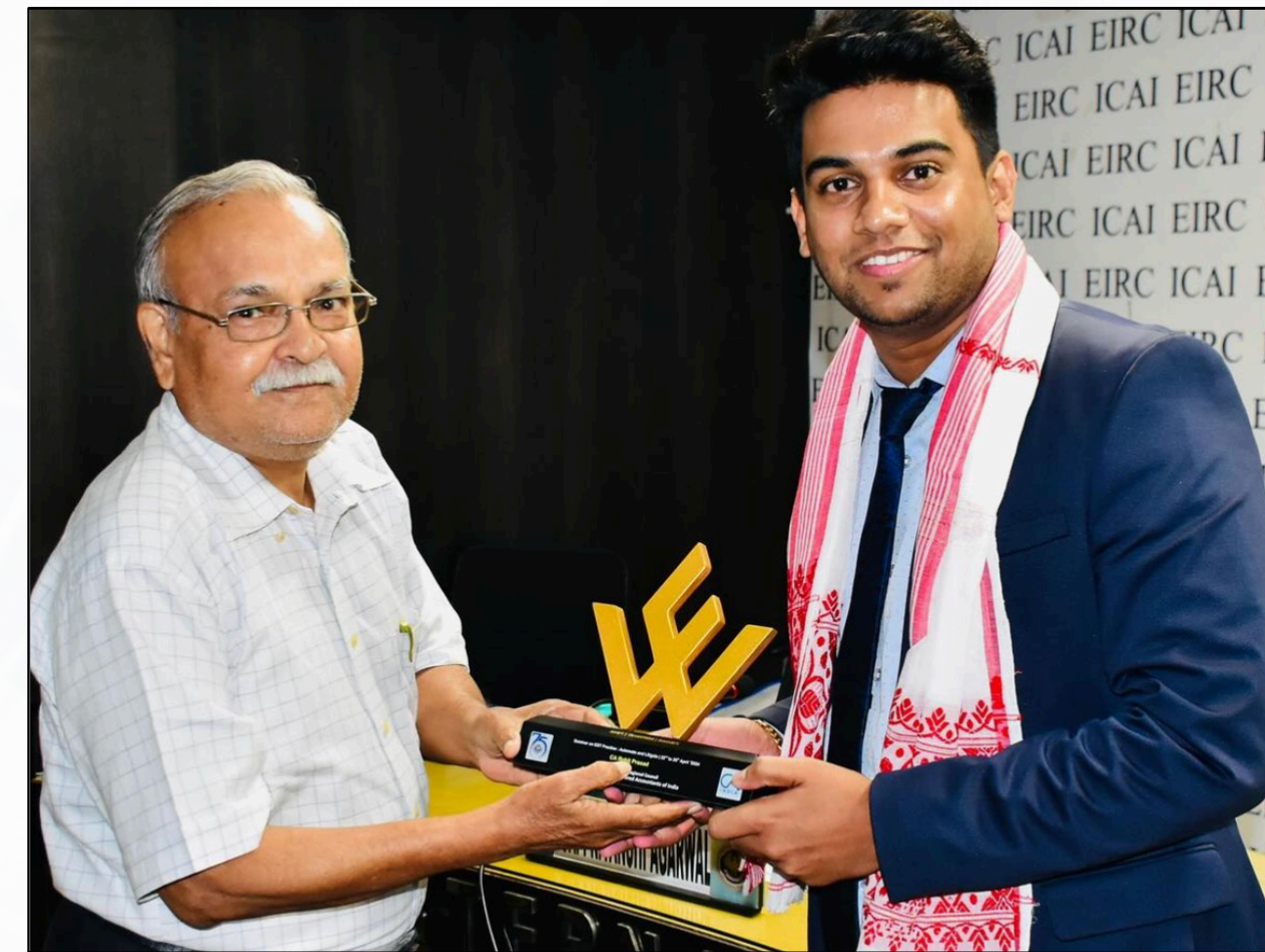
Honoured to receive award at the EIRC - ICAI, for deliberating a seminar on “Decoding System Generated Notices”