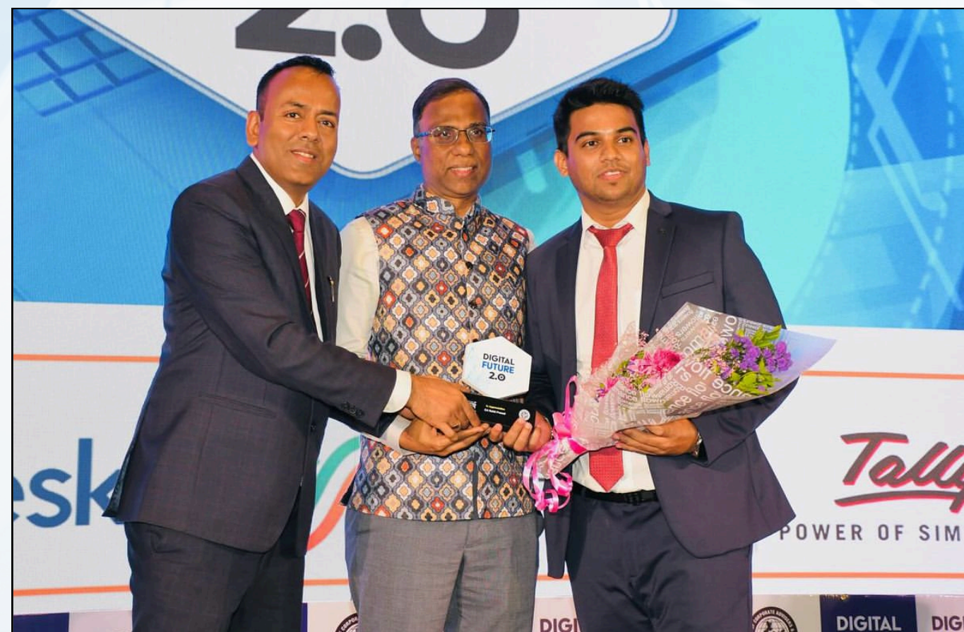
Honoured to receive the prestigious award at the Digital Future 2.0