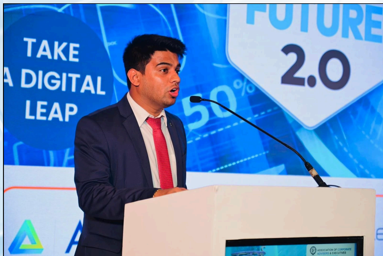
Some glimpses of ACAE Information Technology Conference “Digital Future 2.0”