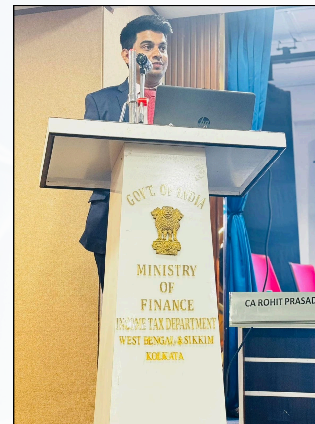
Deliberating on the stage of The Government of India (Ministry of Finance), West Bengal