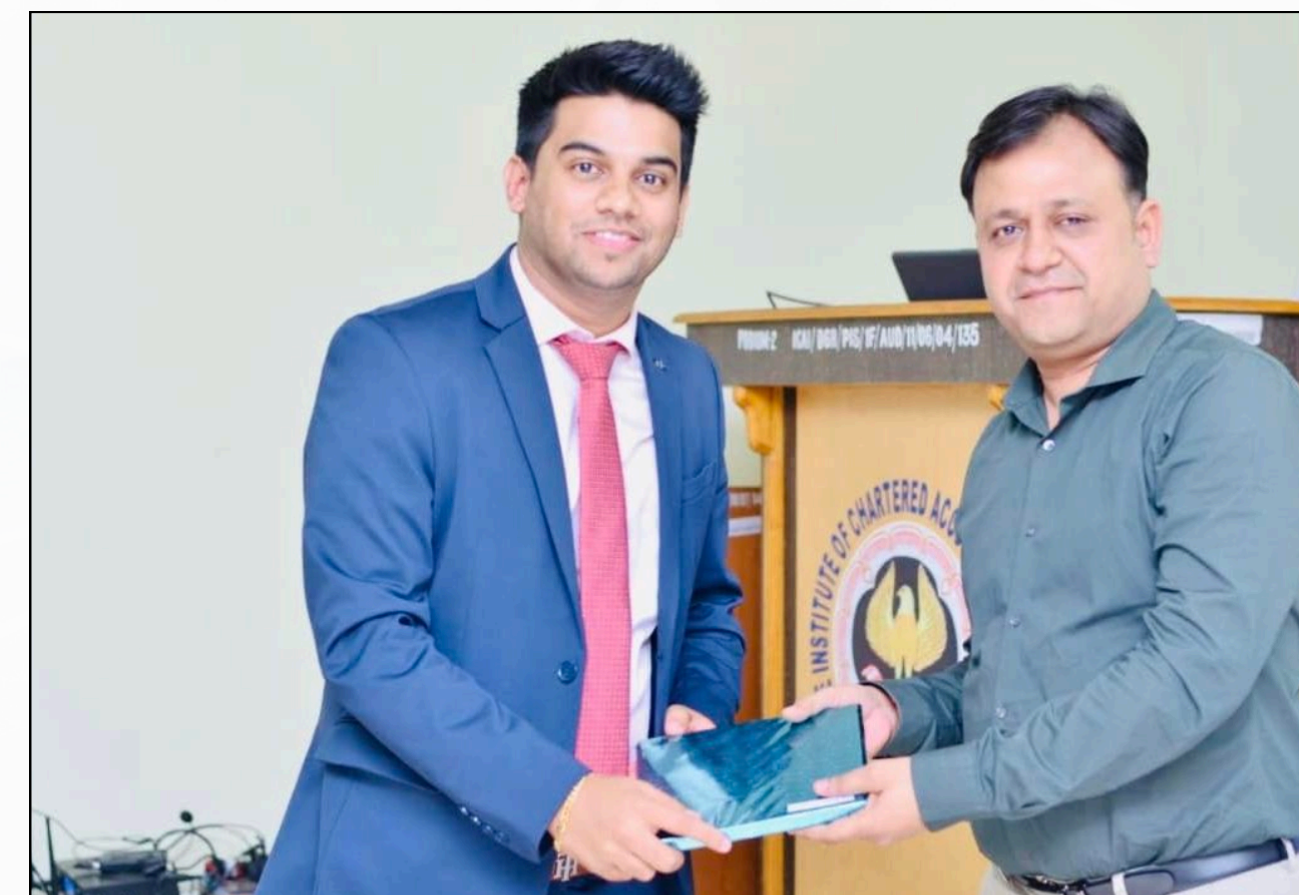
Honoured to receive the award for sharing the insights about “How to Handle GST Litigations”, at Durgapur Branch, ICAI