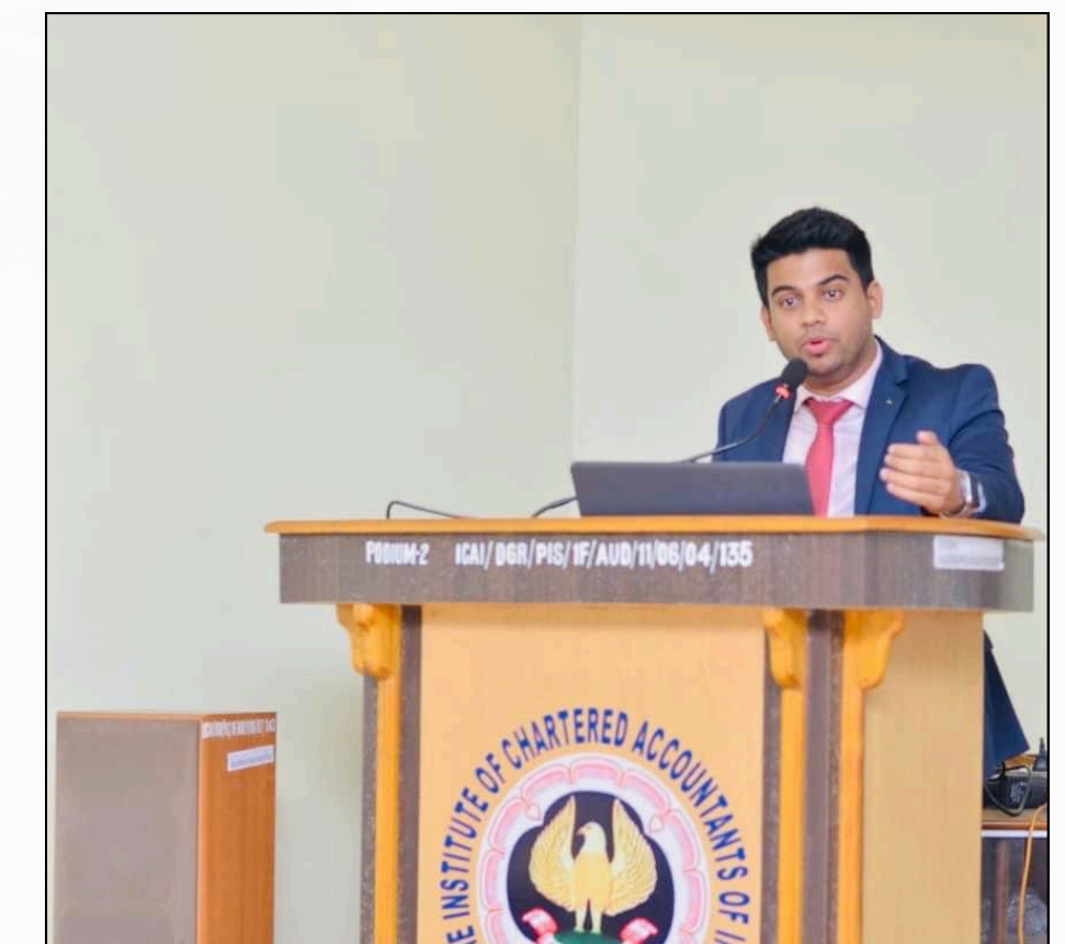
Deliberating a seminar on “How to Handle GST Litigations”, at Durgapur Branch of ICAI