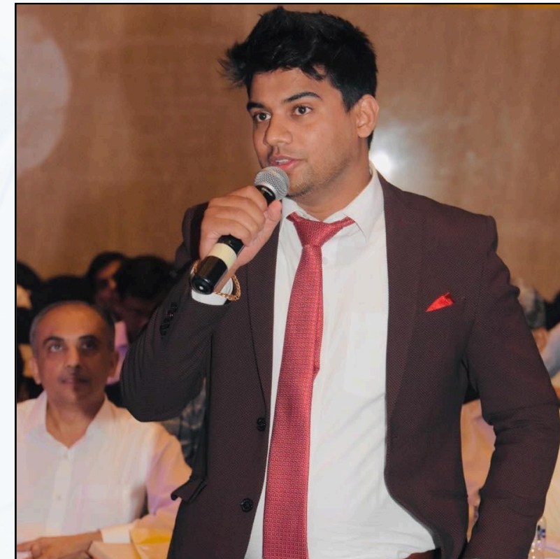
Deliberating at The Lalit Great Eastern, Kolkata